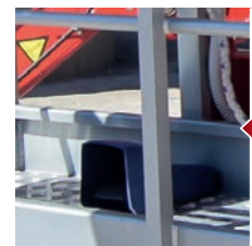
"Dead Man" Safety Device in Basket