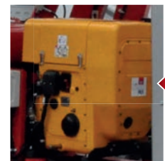
Hatz Silenced Engine