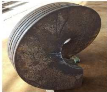
HEAVY DUTY FLIGHTS