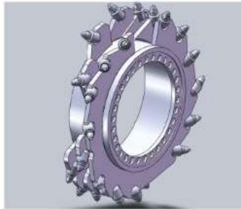
DIAPHRAGM WALL CUTTER WHEELS & SPARES