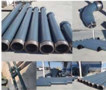
TREMIE PIPE & SPARES