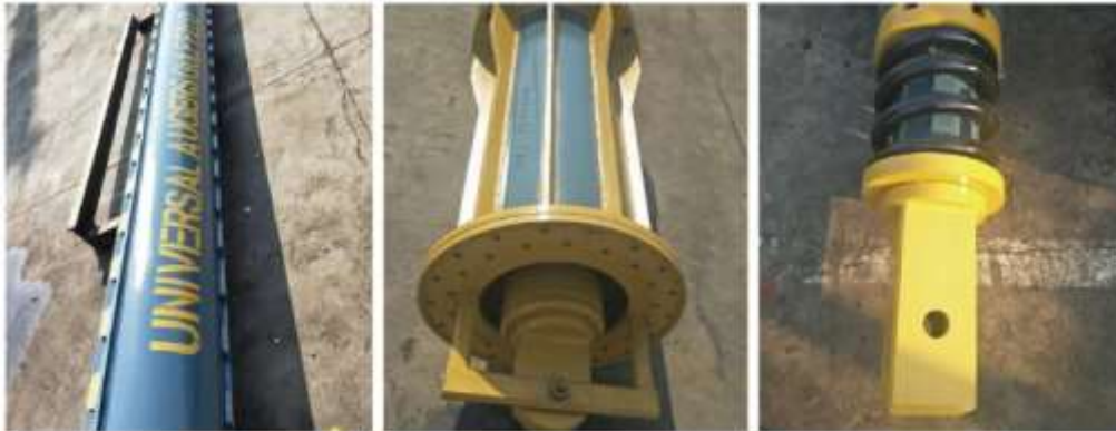
KELLY BARS (Soilmec, Bauer, Sany, Sunward, Mait, Liebherr, Jintai, IMT, Casagrande & XCMG) and SPARES

Universal Augers Gulf FZCO is committed to Design, Develop & Manufacture high Quality Equipment, tools & accessories for foundation engineering & drilling industry. We are the largest supplier in MENA region for Piling, mining, screw conveyor, road construction, offshore & marine industry.