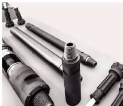
DTH HAMMER & BITS