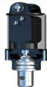
AUGER DRIVE UNIT & Accessories (2T to 50Tn)