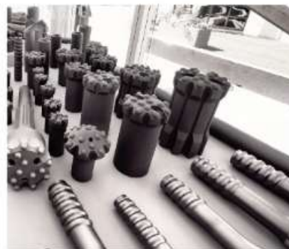
TOP HAMMER BITS & RODS